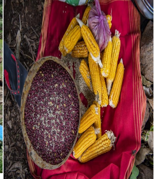
Division of labour in farming

"When a newly married couple wants to set up a house of their own, the entire village would help them in building their house, without expecting any wages," informs Kuruganti, for instance.